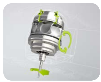
Patented hygienic head system

The optimized blade geometry allows higher rotor efficiency. For maximum torque and optimal power throughout preparation.