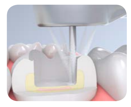
Optimum cooling Thanks to the 4x or 5x spray, the bur tip is optimally cooled in every application position.