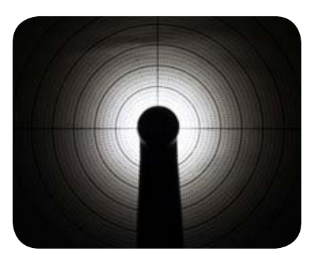
Synea Vision Ring LED+ Shadowless illumination of the treatment size with the unique 5x Ring LED+.