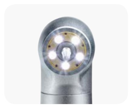
Comfort to the power of 5! Five LEDs and five spray ports revolutionise visual comfort and ease of use.

The world's first sterilizable turbine handpieces with 5x Ring LED+ not only amaze with their shadowless illumination, but prove to be turbines of the highest quality in all other respects too. Discover a completely new working experience — with absolutely no shadows.