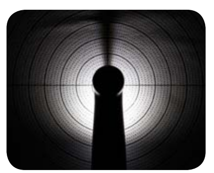
Synea Fusion in comparison with basic LED+.