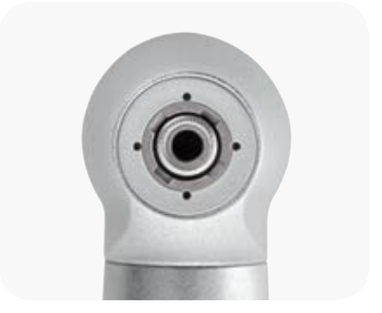
Optimum cooling of four sides Constant cooling and optimal cleaning of the treatment site thanks to 4x spray.