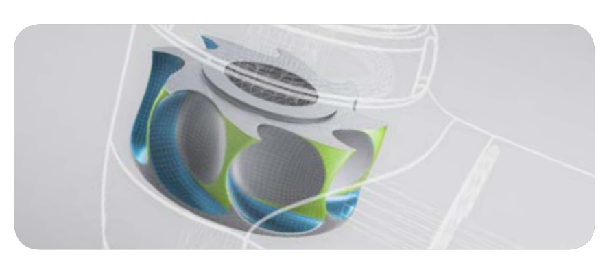
Full steam ahead with the Power Blade rotor

The optimized blade geometry allows higher rotor efficiency. For maximum torque and optimal power throughout preparation.