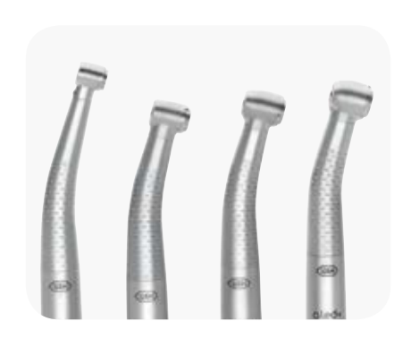
Tailor-made turbines The right head size for optimal access to the treatment site in every application.