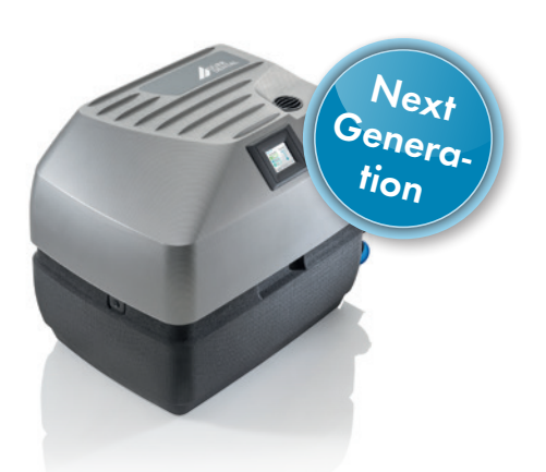
Tyscor VS 4 for 4 operators

Tyscor VS 1 for 1 operator Tyscor VS 2 for 2 operators