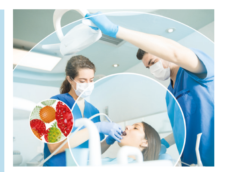
Due to the spread of the spray mist in a radius of several meters, there is a high risk of infection for the surgery team. The contaminated spray mist can be detected in ambient air for up to 30 minutes (Source: Drisko et al., 2000, Bennet et al., 2000)