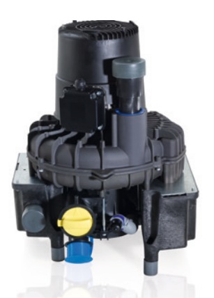
VS 900 S for 3 operators VS 1200 S for 4 operators