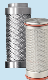
Old: Sterile filter 1640-981-00