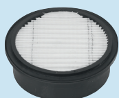
Tornado Compressor suction filter