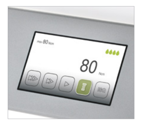
Concentration on the essentials

Implantmed impresses users with its intuitive user interface and simplifies your treatment process.