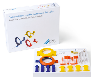
Image Plate and Film Holder System Set Color

Image plate holders from Dürr Dental offer optimum protection for the image plate with their smoothed and rounded edges. The special stepped design of the right-angle technique Color aiming rings enables simple and safe aiming of the X-ray tube. Holders are available for all applications – their use helps to ensure that accurate X-ray images are produced. The colour coding of the various image plate holders enables simple and error-free handling.