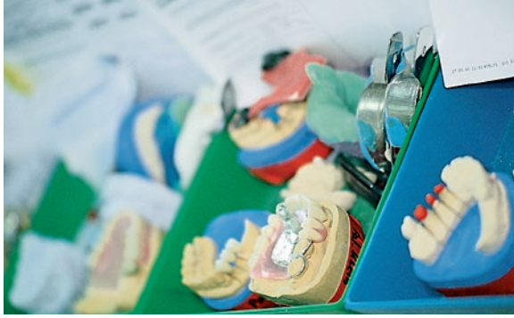
After disinfection in a Hygojet unit, models can be stored safely