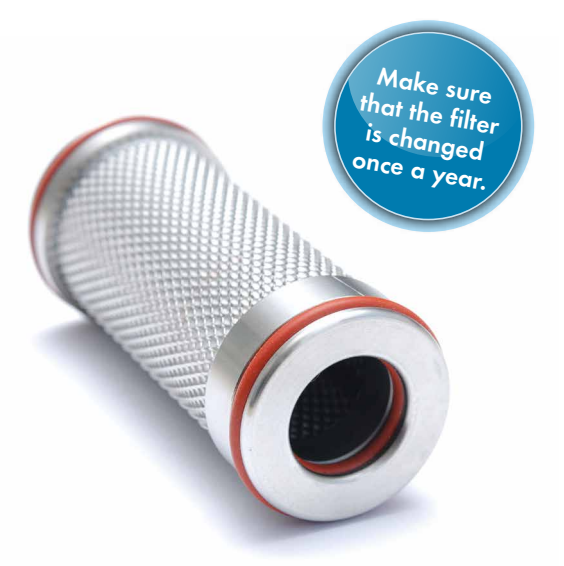
The Dürr Dental bacteria filter is a high-performance particulate air filter with filter class ULPA U16 (according to standard EN 1822-1:2019-10) and ISO 65U (according to standard ISO 29463-1:2017).

The filters installed in the Dürr Dental compressors ensure that consistent performance is maintained and will help preserve the value of your compressed air system. In conjunction with the membrane drying unit, the bacteria filter rules out additional contamination with microorganisms. The filters are incredibly easy to change – and only need to be changed once a year to deliver full power and perfect assistance for your treatment results.