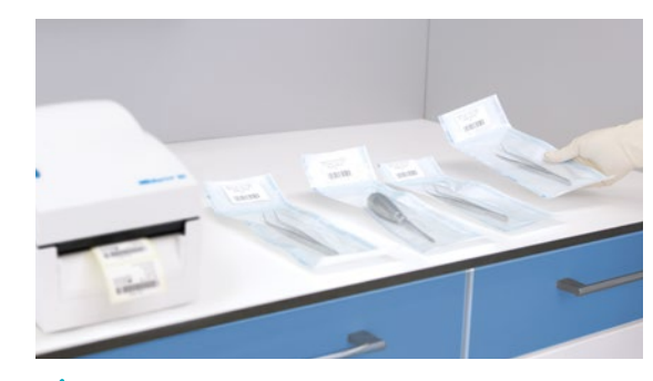
✓ Labelling with MELAprint 80