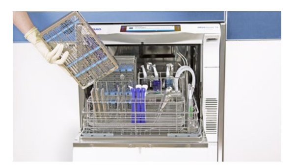
✓ Cleaning & disinfection with MELA therm