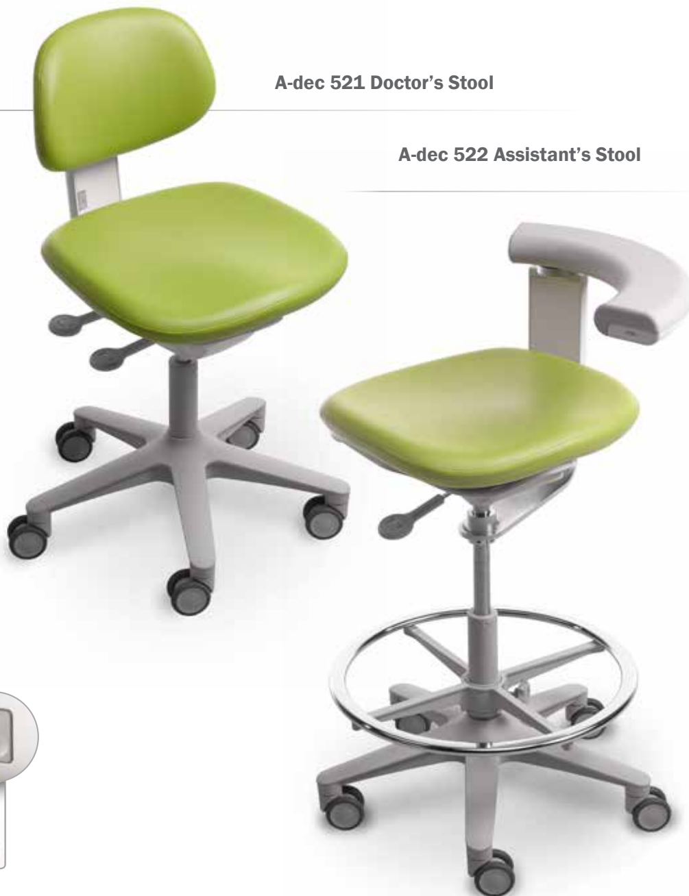
A-dec 522 Assistant's Stool