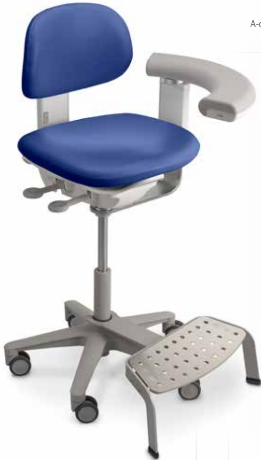
A-dec 521 Doctor's Stool with Optional Swing-out Armrests