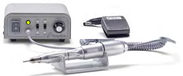
Inludes AHP-101 Handpiece